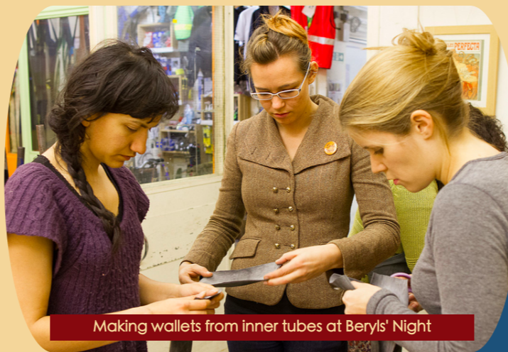
Making wallets from inner tubes at Beryl's Night