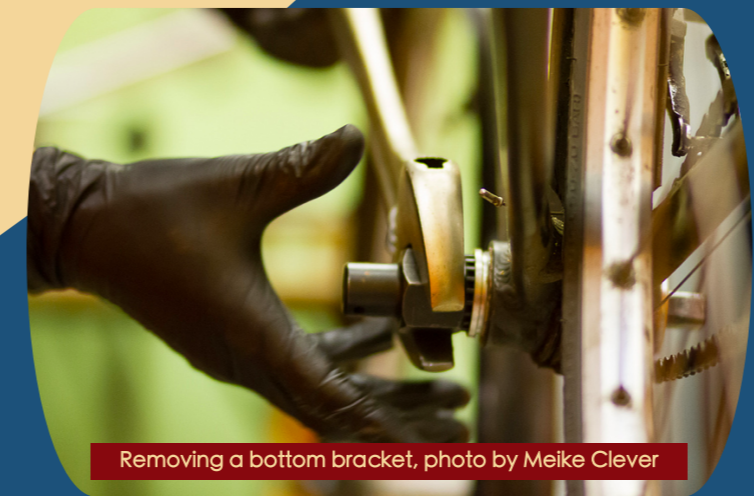
Removing a bottom bracket