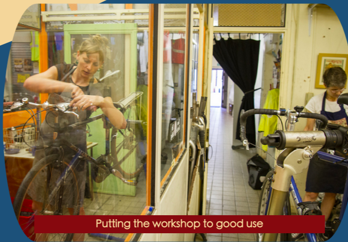
Putting the workshop to good use