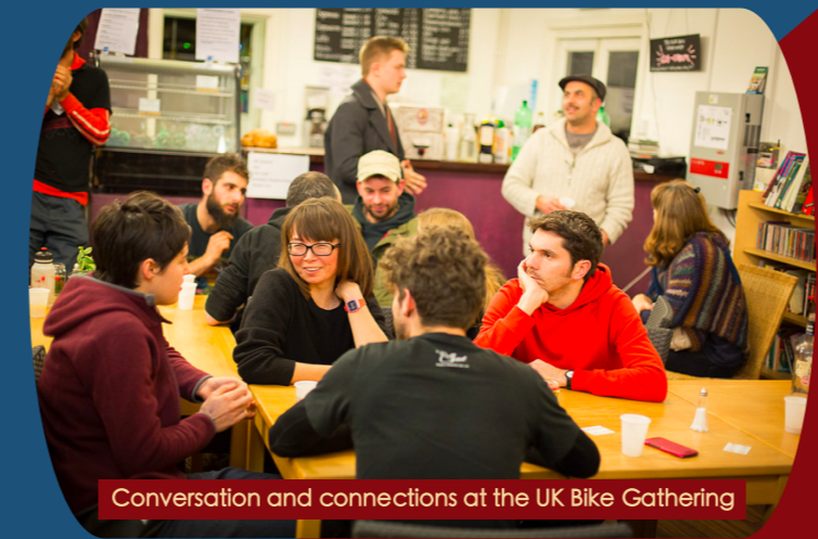
Conversation and connections at the UK Bike Gathering